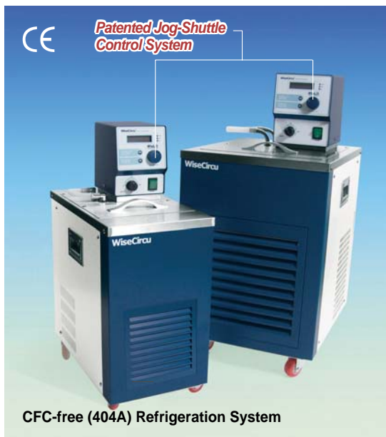
CFC-free (404A) Refrigeration System

Digital Fuzzy Control, Back Light LCD, CFC-free Refrigeration, 6-/8-/12-/22-/30- Lit., -20°C~100°C, ±0.1°C