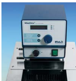
Efficient Use of Bath with Level Sensor